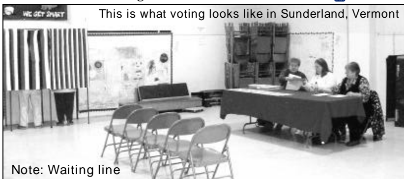
Note: Waiting line